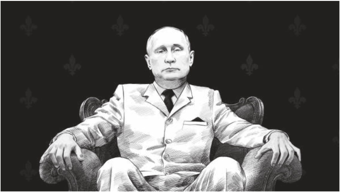
saying about their own country, in Russian.

I just don’t understand why English-language commentary (all non-Russian commentary, actually) is so far removed from what patriotic Russians living in Russia are