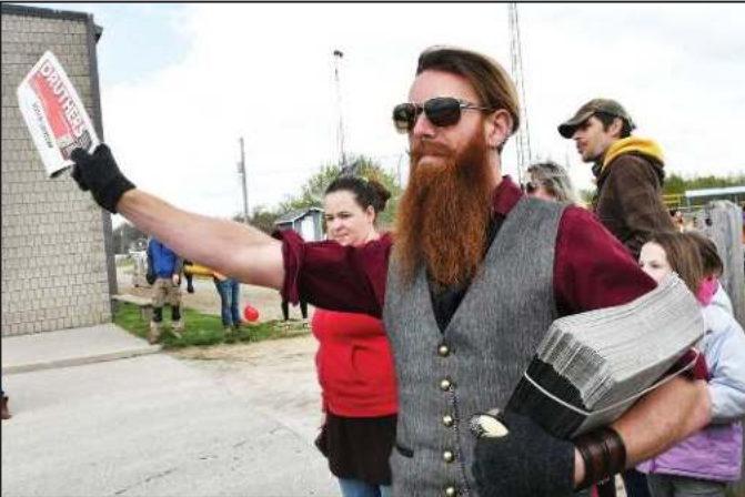
Peedj Mon London, Ontario