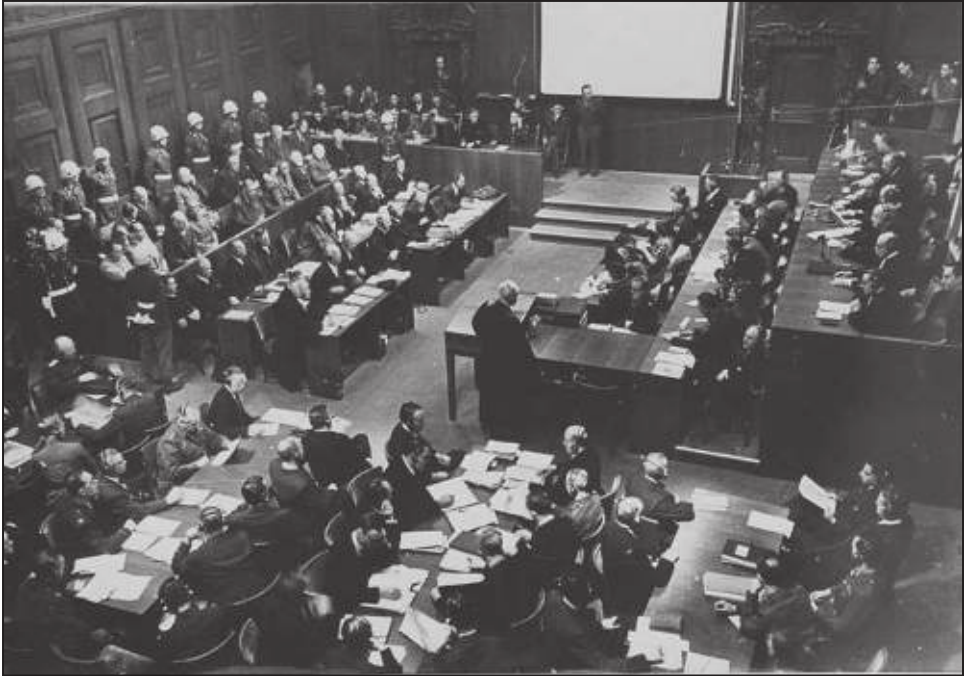
Nuernberg [i.e., Nuremberg] trials in session. November 27, 1945.

Since the rollout of the experiment and listed under the CDC VAERS reporting system over 4,000 deaths and 50,000 vaccine injuries have been reported in America. In the EU over 7,000 deaths and 365,000 vaccine injuries have been reported. This is a grievous violation of this code.