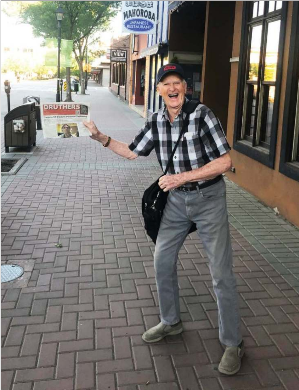
Oldest Paper Boy In Canada?

Do you know someone in your community who delivers Druthers and should receive a shout-out in next month's issue of Druthers ? We'd love to hear about it. Please send photos and a blurb about the person to info@druthers.net and you just might find it in next month's issue.