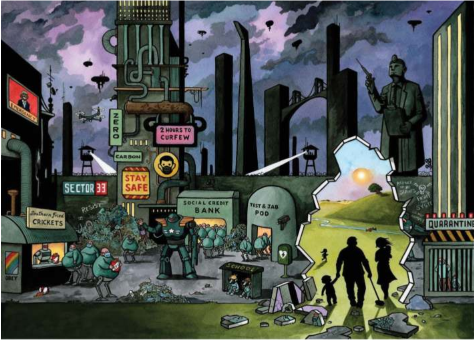
Illustration by BobMoran.co.uk