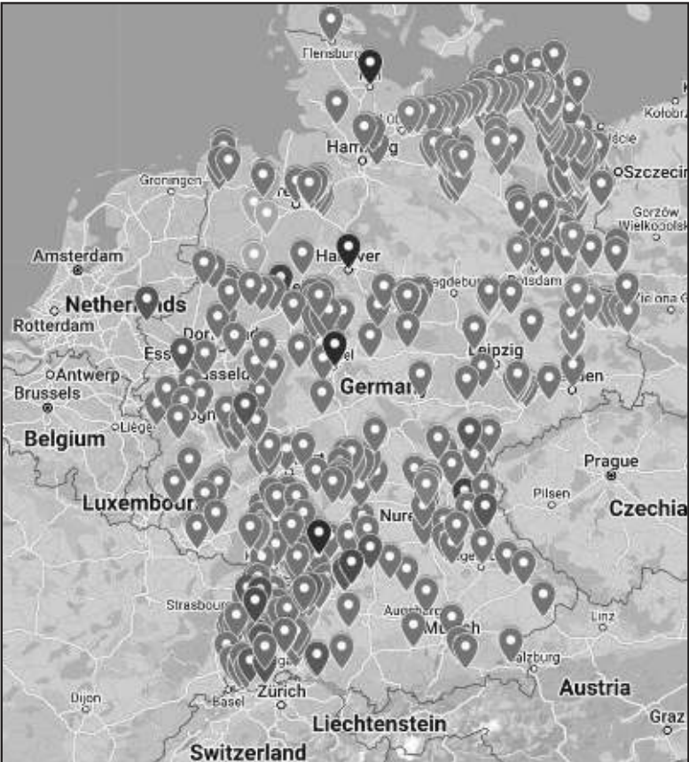
Here is an overview of all the current actions. There are hundreds.