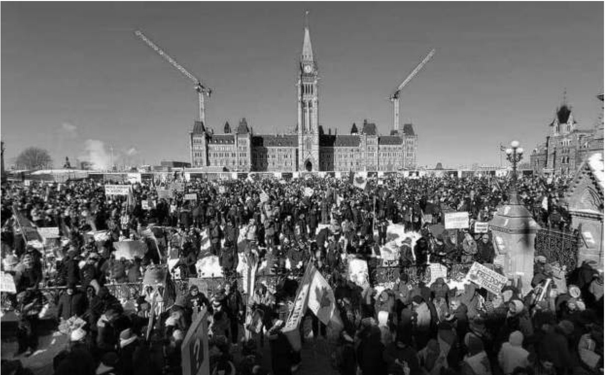
The day Freedom Convoy 2022 came to life. January 29th, 2022, Ottawa.