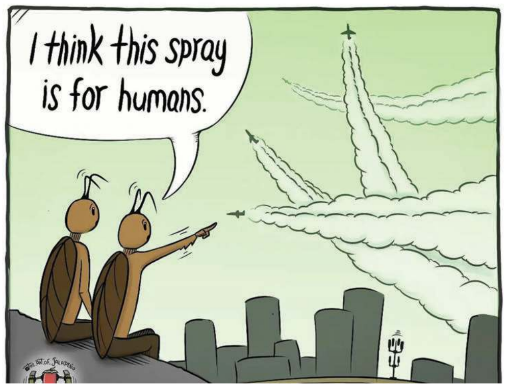
Illustration by @the_art_of_jalapeno

An Ontario Doctor who publicly rejected COVID-19 mandates is found guilty of spreading "misinfor mation, " raising free speech concerns. The Ontario College of Physicians and Surgeons ruled in a disci-