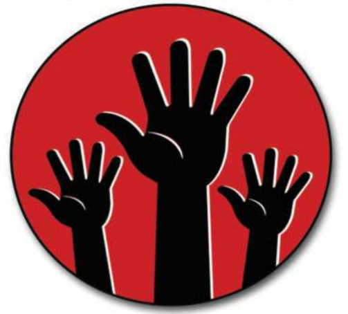
Or maybe you can help in other ways? We'd love to hear from you. Visit us at: druthers.net/volunteer

Your support is vital to the continued success of this paper.