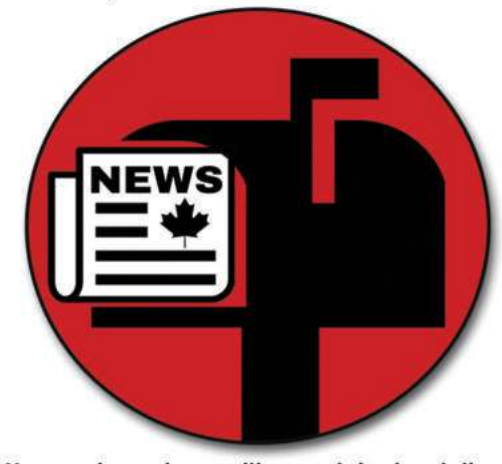
Never miss an issue with a postal subscription. Just cover the cost of s/h. Sign up at: druthers.net/subscribe

Have your Druthers delivered right to your door each month.