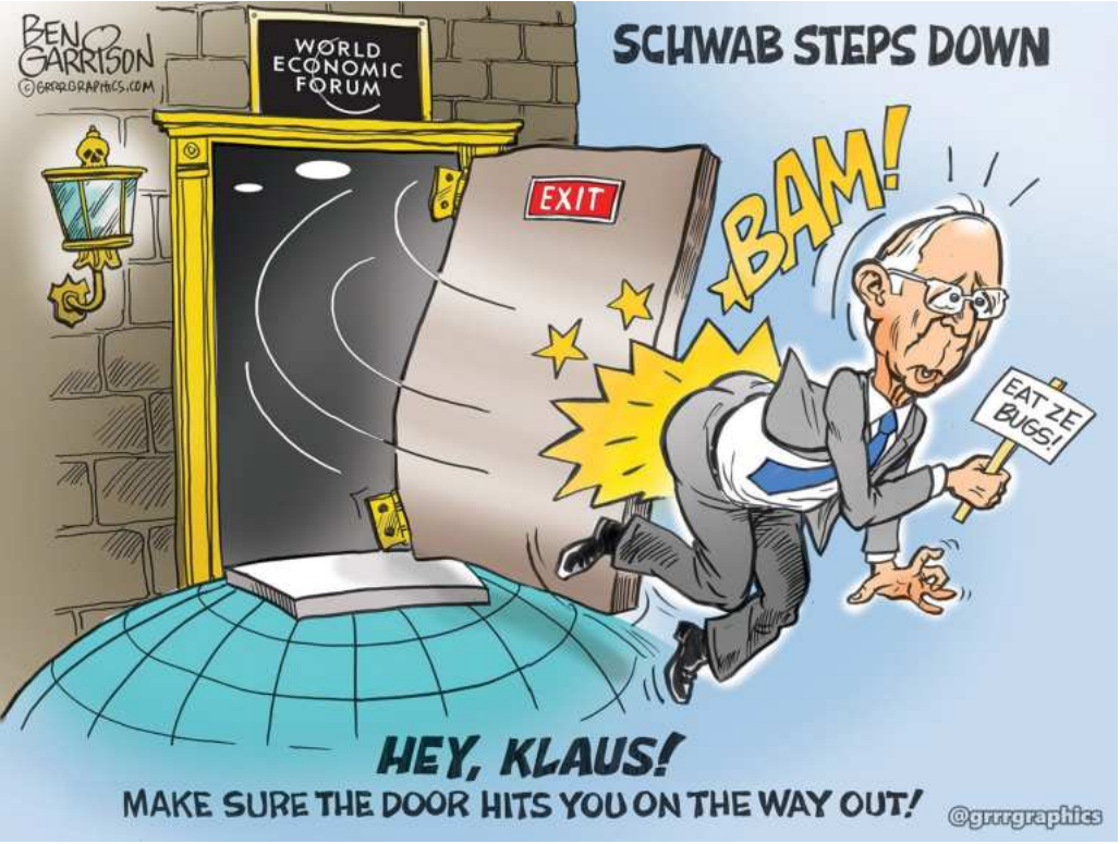
"Goodbye Globalism"

• The Canadian Taxpayers Federation recently released bombshell information: Global Affairs Canada dumped $573,500,000 into offshore