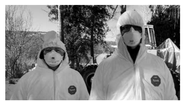
CFIA Agents at Universal Ostrich Farms in B.C.