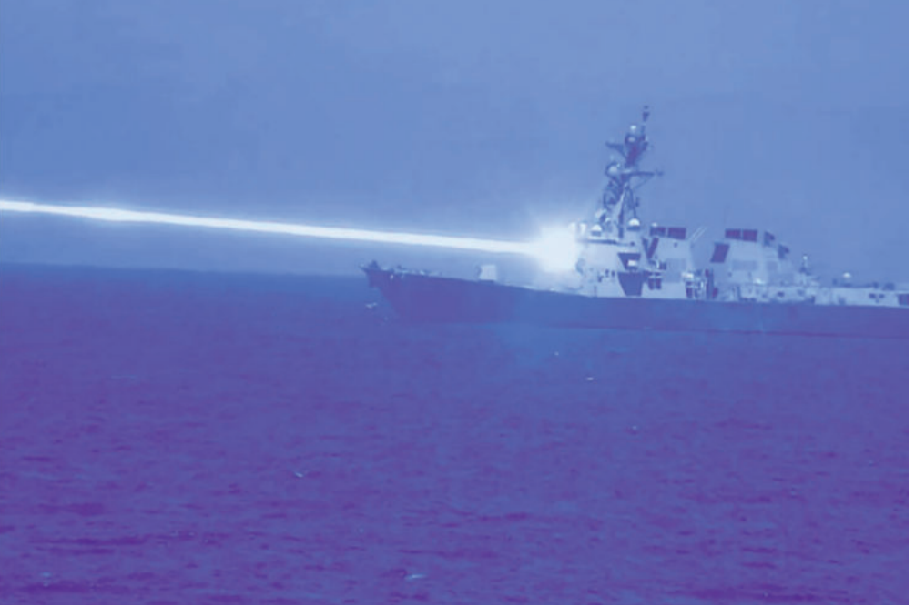
In this undated photo from fiscal 2024, the Preble fires its HELIOS system during weapons testing. (Colourized Photo)

This means HELIOS can not only shoot down drones and small boats but also blind surveillance equipment and disrupt enemy targeting systems, shifting the balance of modern warfare toward more silent, electronic-based engagements.