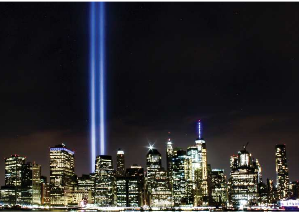
New York City skyline showing the blue beams of the 9/11 "Tribute in Light"

It's a distraction, keeping eyes off DEW.