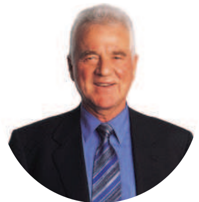
FRANK STRONACH Founder, The Canadian Economic Charter

The economy is driven by three forces: smart managers, hardworking employees, and investors. And workers have a moral right to some of the profits, because without workers, a company cannot make a profit.