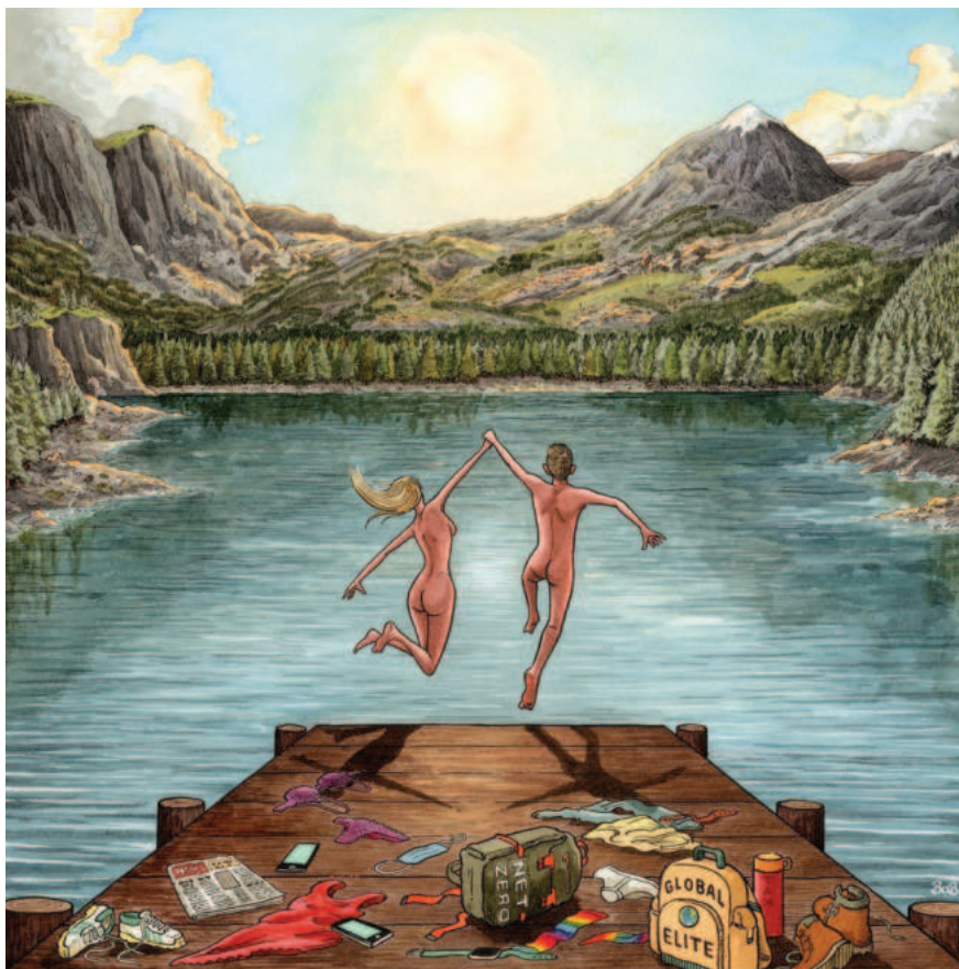
Art by Bob Moran at: BobMoran.co.uk

• A study published in the International Journal of Vaccine Theory, Practice, and Research (Diblasi et al. ) reveals startling findings: "At least 55 undeclared chemical elements"—including toxic arsenic, aluminum and mercury—were detected in COVID-19 shots. The groundbreaking analysis used Inductively Coupled Plasma Mass Spectrometry (ICP-MS) to uncover the cocktail.