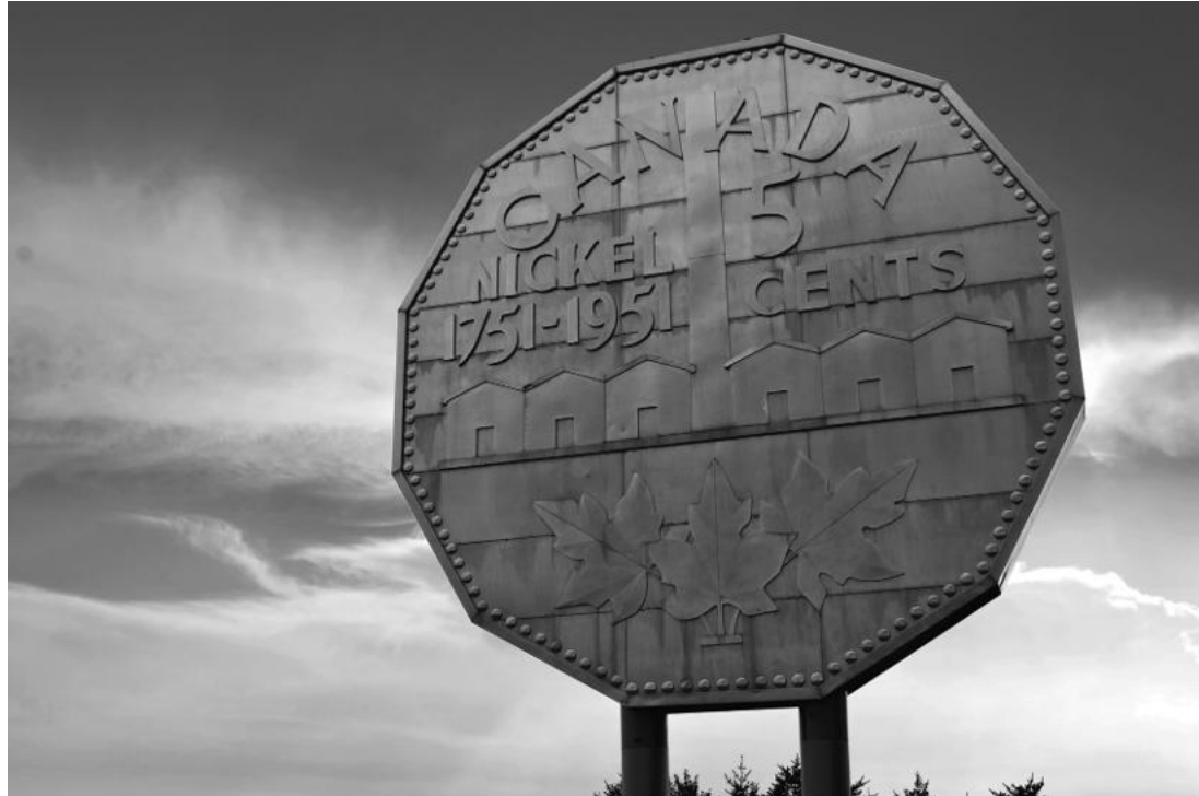
The Big Nickel in Sudbury Ontario Canada.

This initiative is backed by Power Corporation , the family business of the Desmarais family . Most people haven't heard of them, but they are the closest thing Canada has to royalty. They have been the "Prime Ministers' Club" for 50 years—linked directly to Trudeau, Mulroney, Chrétien, and Martin. They founded the CCBC in 1978. They aren't just "watching" this happen; they are the architects of the bridge , training our leaders to view Canadian resources as a global supply line