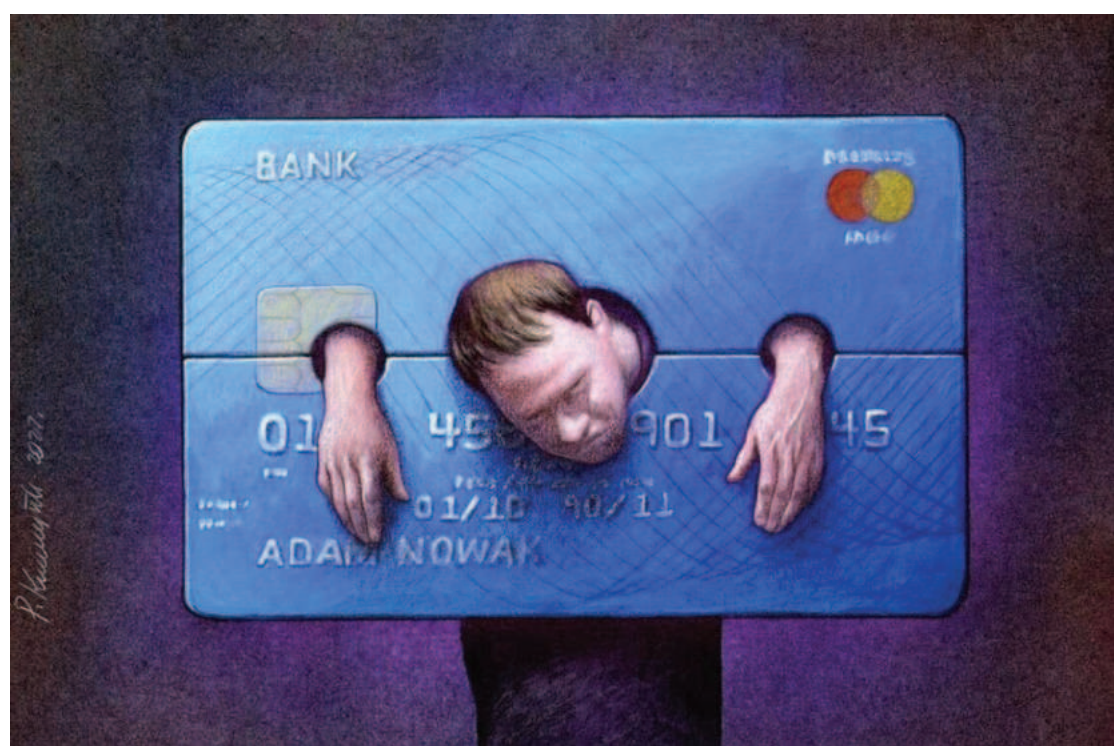
Artwork by: Pawel Kuczynski at facebook.com/pawelkuczynskiart

• After pioneering the world's first large-scale program to prescribe pharmaceutical-grade opioids to individuals with opioid use disorder in 2020, the BC government has announced it will end the take-home portion of its "safe supply" initiative. The decision follows extensive reporting revealing that drugs dispensed through the program were being diverted to the black market.