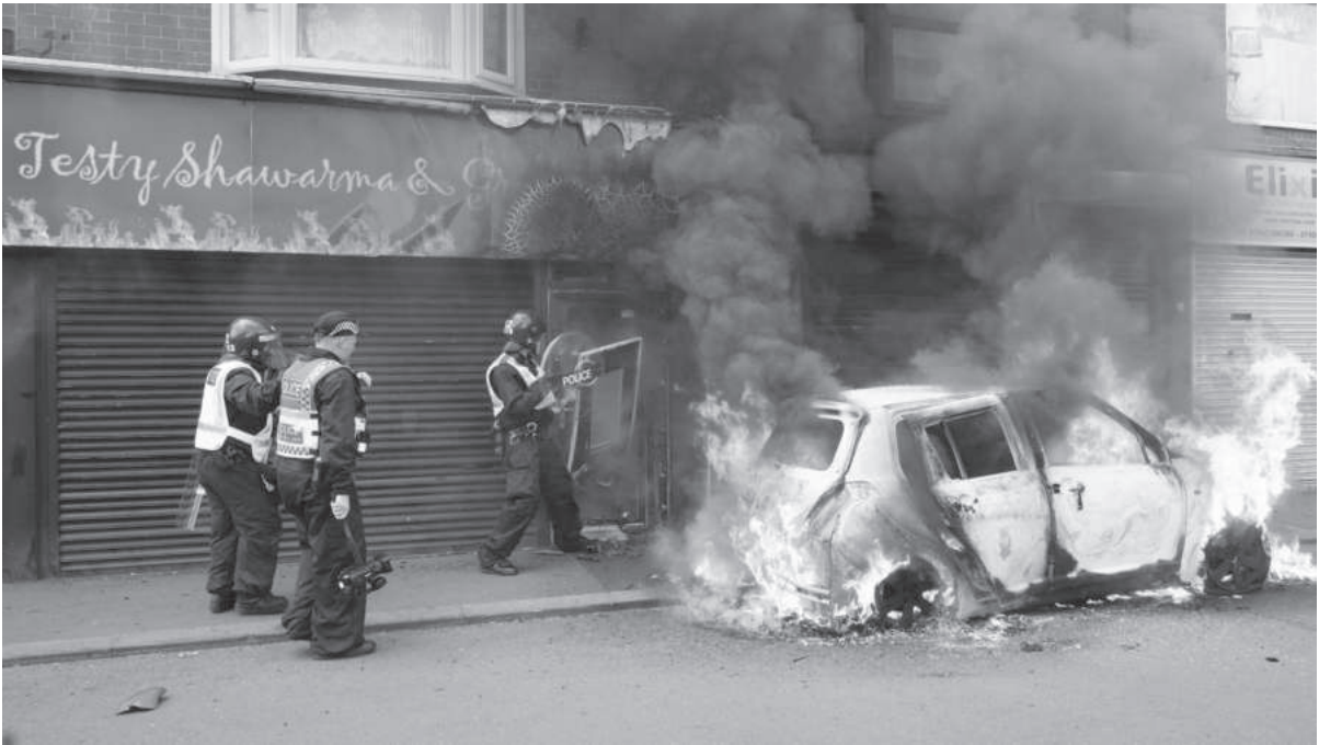
A car burns on Parliament Road, in Middlesbrough, England, recently.

It is quaint to think that, had accurate information about the attacker been immediately known, there would have been no viral outrage and protest. Information can direct where energy flows, but the energy and tension were long there.