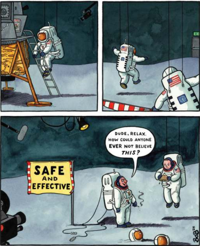
Artwork “False Flag” by BobMoran.co.uk